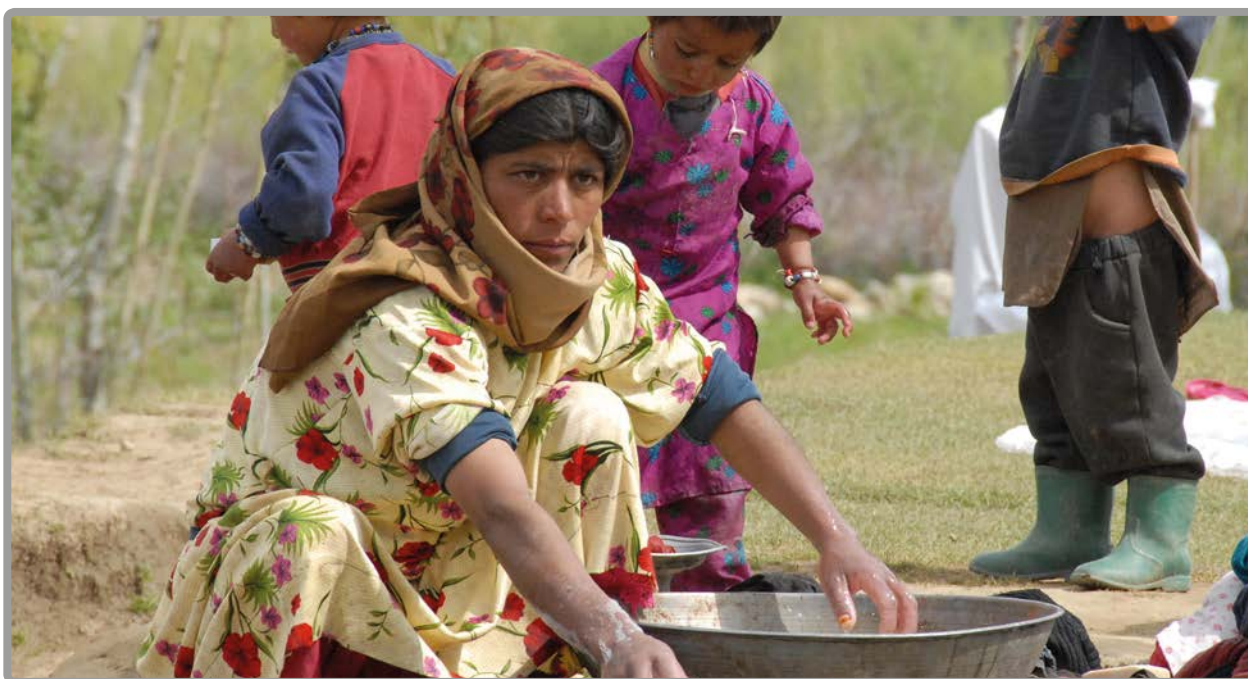
A new water pump has made domestic chores easier and reduced waterborne diseases in Nechem, Afghanistan.

In South Asia and elsewhere, the majority of water users access the resource directly from nature, meaning that the poor and marginalised often are the most vulnerable and have the least resilience to climate-induced shocks and stresses. There are major equity deficits in water management in South Asia. Equity spans several contexts—water allocation across sectors; access to water services; water for life, productive activities and cultural needs; decision-making around water; etc.—but, across all of them, the poor and marginalised have heightened vulnerability to climate risks.