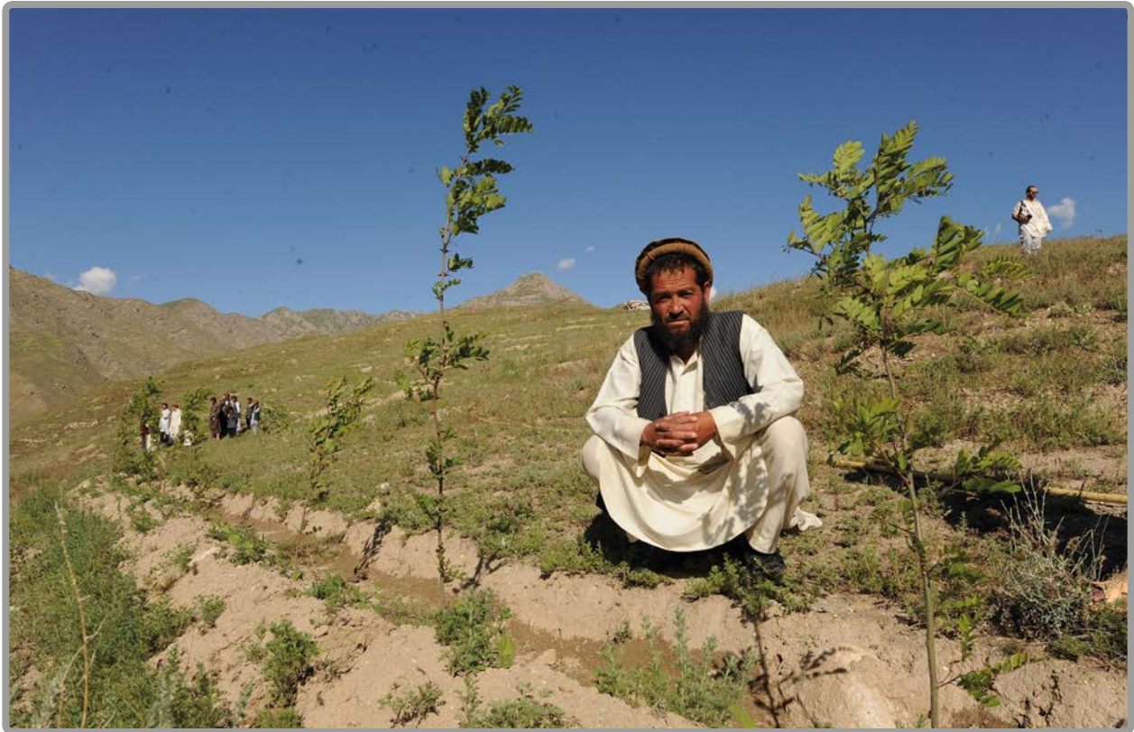
Farmer with his newly planted walnut saplings, reforestation project in Baharak, Afghanistan.

and Water and other relevant line agencies, civil society and academia. The strategy, currently under development, presents a range of measures aimed at enhancing: