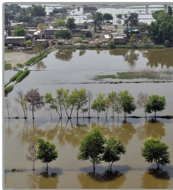
Flood affected areas in Multan, Pakistan.

Agricultural policy can also support CRWM by aligning food production with regional water resource endowments (Verma et al., 2009) to minimise potential impacts of climate change and support the drive for food security (a prime driver of irrigation and water management investments in South Asia). It could do this by providing water-scarce regions with more water from water-rich regions to prevent mining of local (ground) water resources (Kumar et al., 2012). Financial incentives (and disincentives) to encourage the cultivation of crops best suited to different agro-climatic zones and thus better able to withstand climatic variability