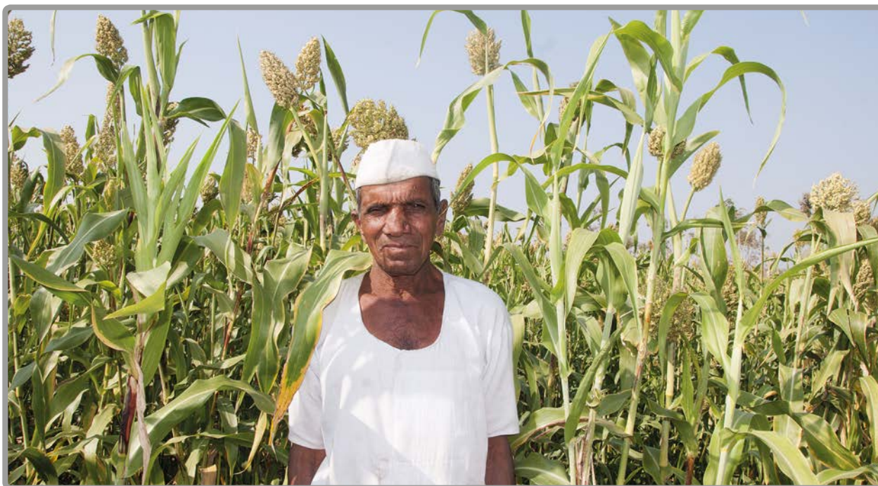
Farmer in his sorghum crop field, Amravati, Maharashtra, India.

Therefore, the intervention aligns with Criterion 1 of CRWM, as it integrates information on future climate change and variability in the JSA. It also aligns with Criterion 2, as it proposes actions to enhance redundancy (e.g. groundwater reserves) and adaptability (e.g. improved advisory services). Such measures would substantially reduce the vulnerability of farmers in the state, most of whom are small and marginal, as well as other socio-economically compromised sections of the population, to water scarcity caused by climate change. Therefore, it aligns with Criterion 3 as well.