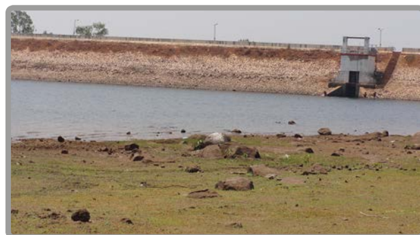
Kodar water reservoir in Mahasamund District, Chhattisgarh state, India.

The most common approach to augmenting local resource supply, particularly during the dry season, is water harvesting. Soil moisture conservation interventions, typically undertaken in watershed programmes, are also employed. Soil and water conservation as well as tank repair, rehabilitation and de-silting are popular in South Asia but the critical distinction for CRWM is whether their design