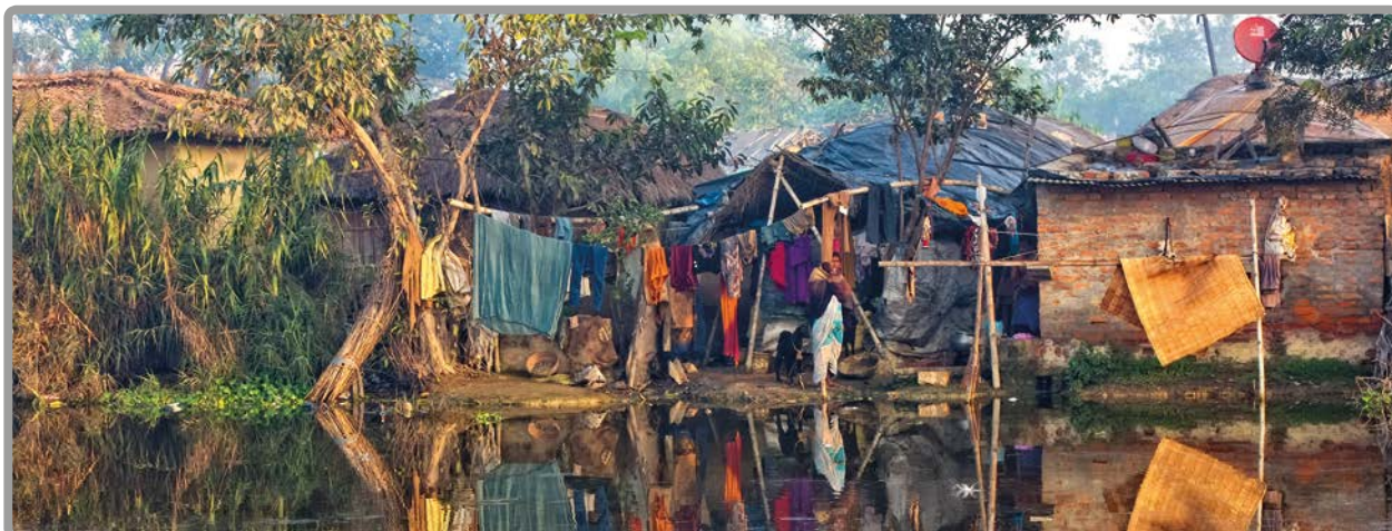
Houses in Raxaul, Bihar State, India.

The Government of Bihar had been aware for some time of the impact of erratic monsoons, floods and droughts on agriculture-based livelihoods (such as fisheries and livestock). However, there was a need for clear policy directions on water management in