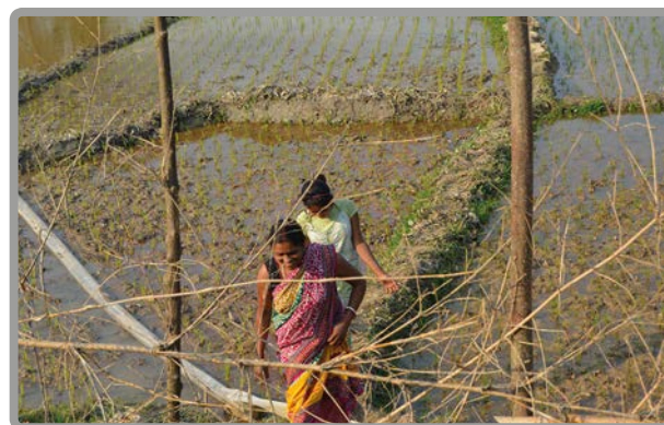
Traditional agricultural practices in Assam, India.

A sound strategy to address anticipated water shortfalls—and more frequent and intense droughts—is to reduce demand. Allocating water to economically and ecologically more efficient uses (within the water sector and across sectors) and reducing water pollution are two key sets of demand management interventions (Frederick, 1992). In agriculture, by far the largest user of water in South Asia, options include shifting to less water-