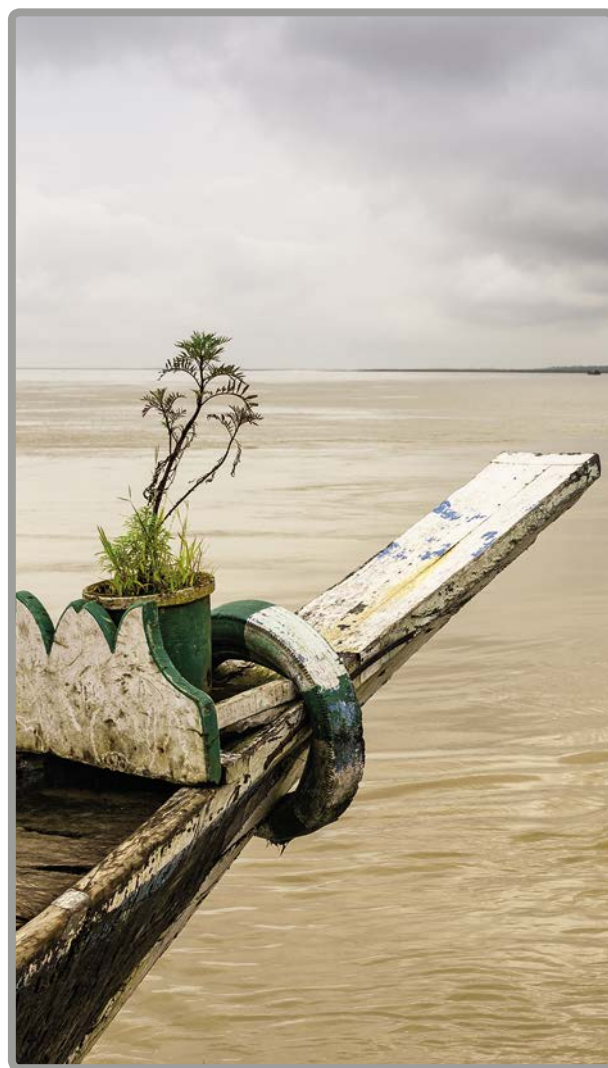
Brahmaputra river near Jorhat and Majuli island, Assam, India.