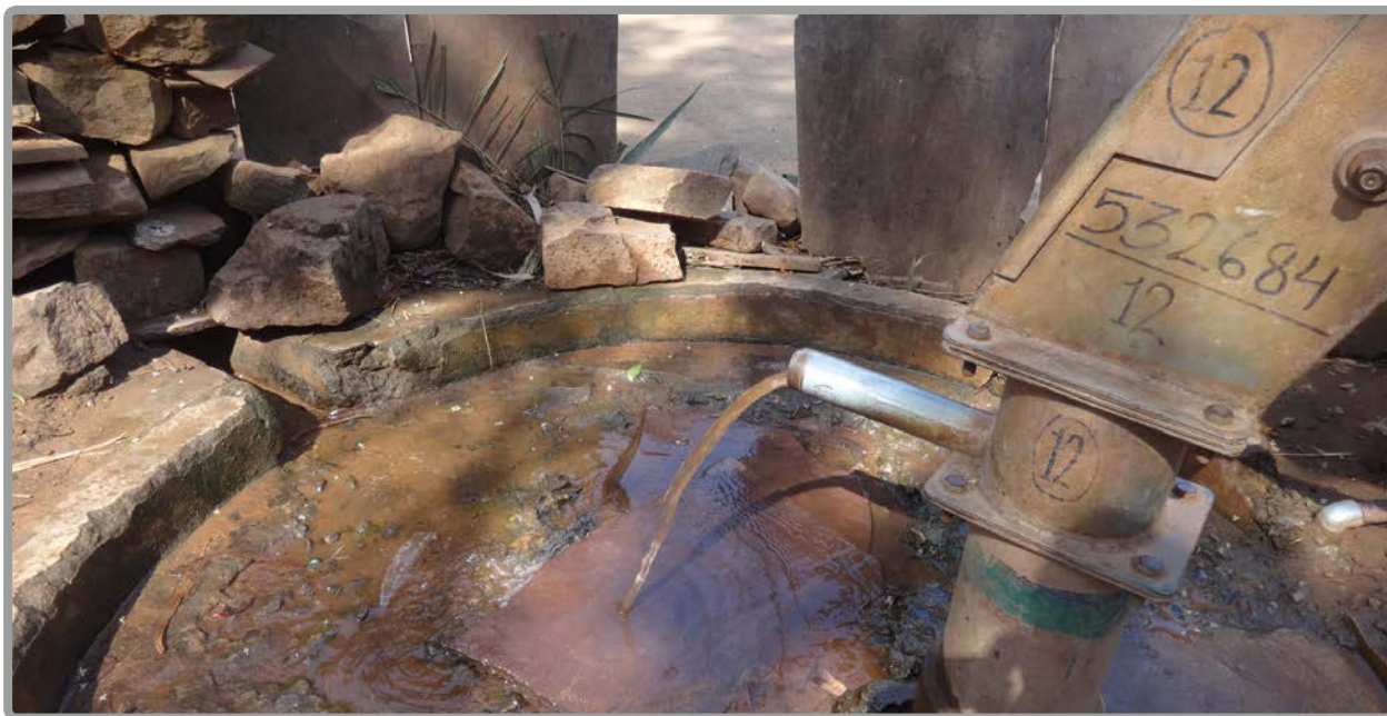
Handpump with iron water in Mandawa village, Chhattisgarh state, India.

is also developing strategies to institutionalise climate-informed water resource planning and management.