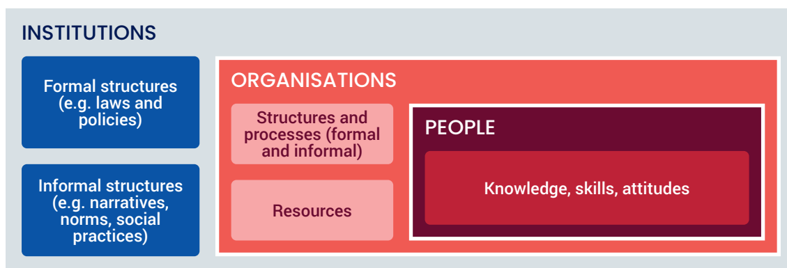
Figure 1: Three types of capacity