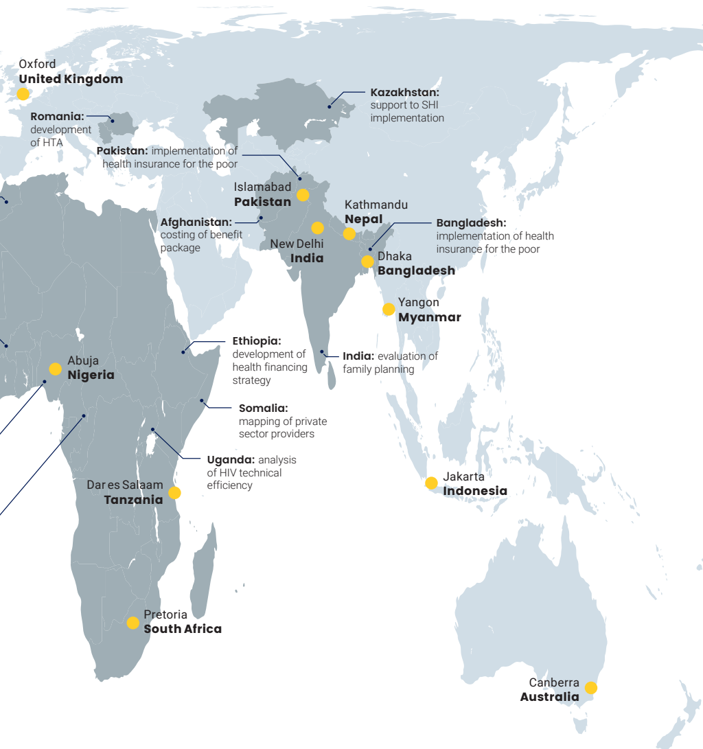
The map above highlights some examples of our work, and is based on a Gall-Peters projection