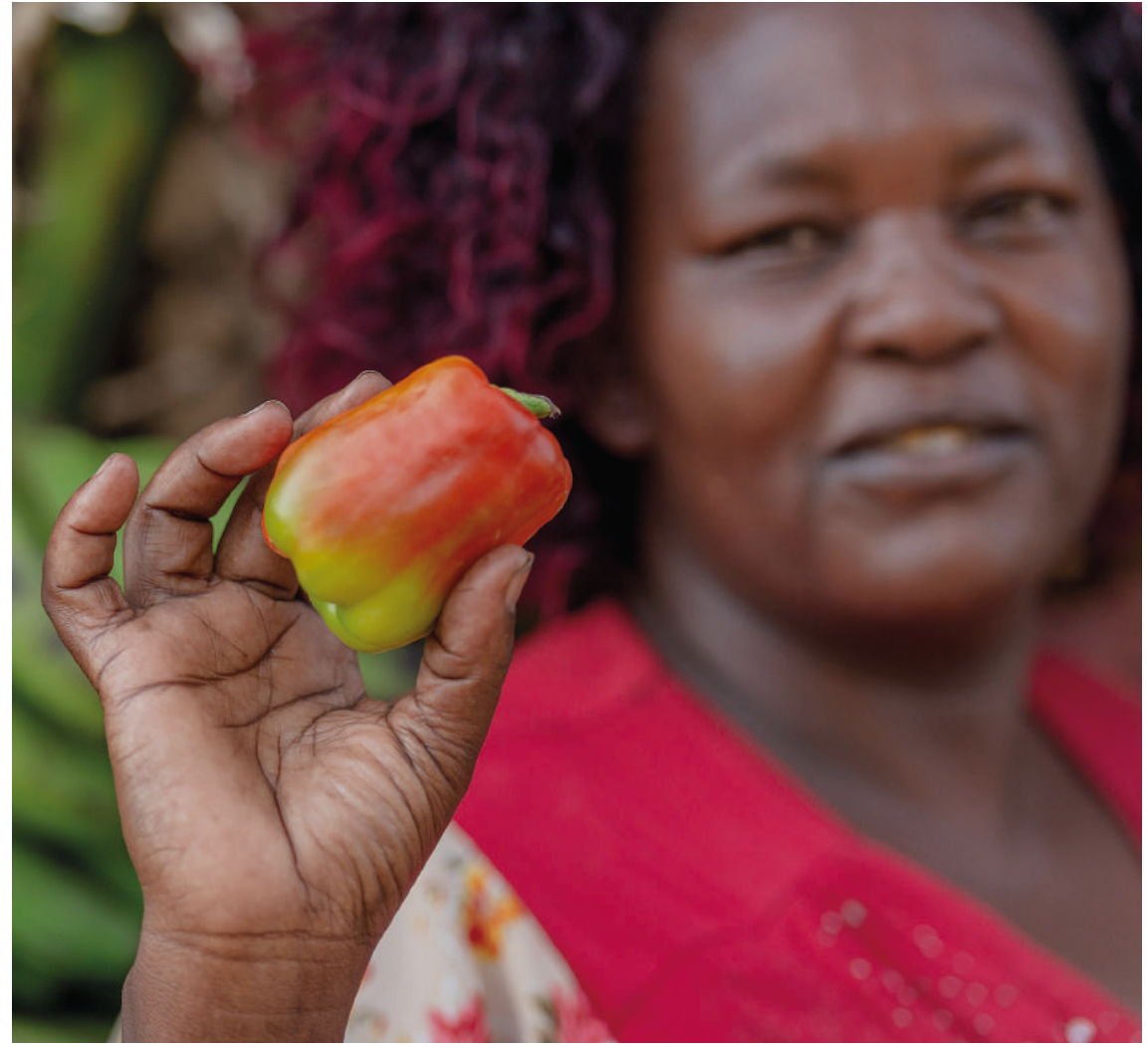
09 Oxford Policy Management | In depth | 2019