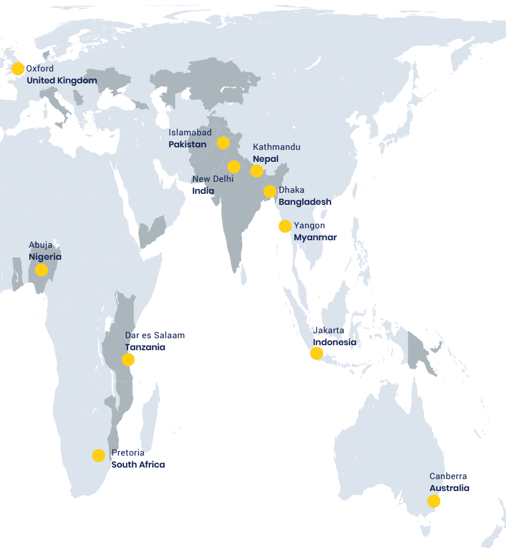
Above: Map shows a selection of countries we have worked in and our office locations.

Map above is based on a Gall-Peters projection