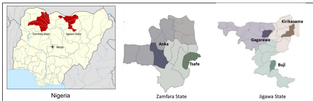
Figure 1 Location of the CDGP states and LGAs